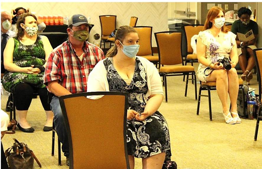
Partners in Policymaking Final Class and Graduation; staying safe and social distancing.