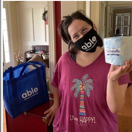
Bag, hand sanitizer, refill bottle, paper towels, masks, tissue, gloves, pandemic kits