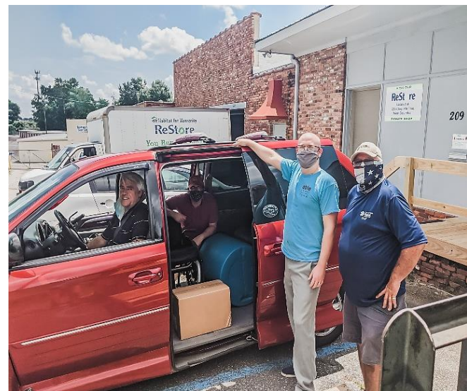
Delivering supplies.... Becoming Essential!